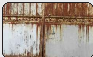
Ponçage 1er passage, gros grain 1st sanding passage, big grit