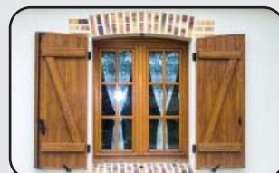
Respecter les matériaux Respects curved surfaces