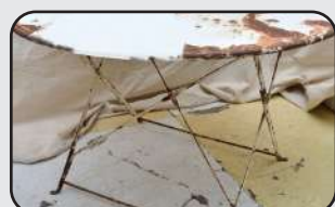
Décaper les surfaces planes Strip flat surfaces