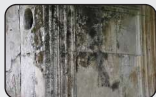
Brosser les impuretés de la pierre Brush impurities from the stone