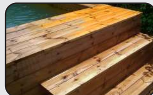
Nettoyer et brosser le bois Clean and brush the wood