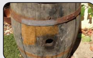
Respecter les surfaces courbes Respects curved surfaces