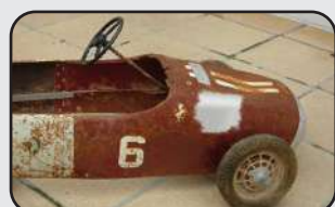
Finition pour surfaces courbes Finishing for curved surfaces