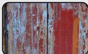
Ponçage de finition Finishing sanding