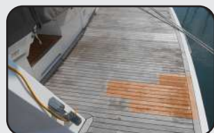
Décaper le bois Stripping the wood